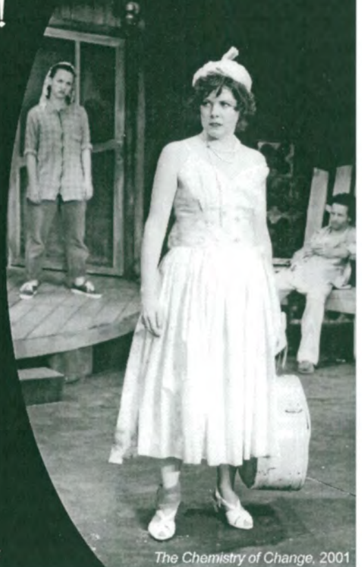
The Chemistry of Change, 2001